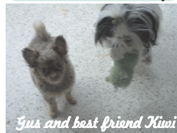
Gus and best friend Kiwi

We adopted a one pound Chihuahua, Gus, when he was 8 weeks old. He had severe kennel cough 24 hours a day and couldn't sleep. I applied peppermint to my hands and petted him